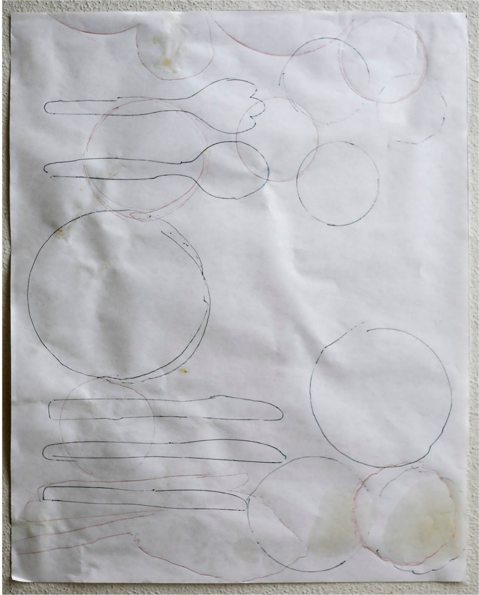
Celebrations: Spare some curry