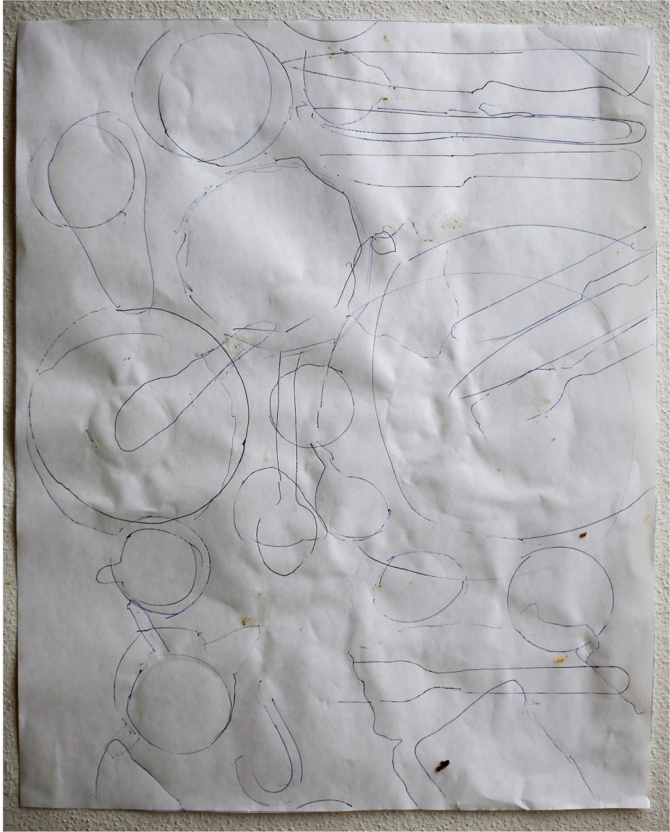
Celebrations: Spare some avocado